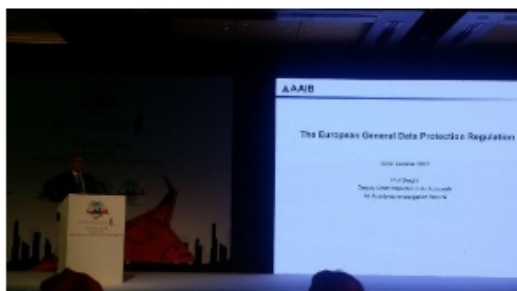
(ISASI 2018, Dubai, UAE)