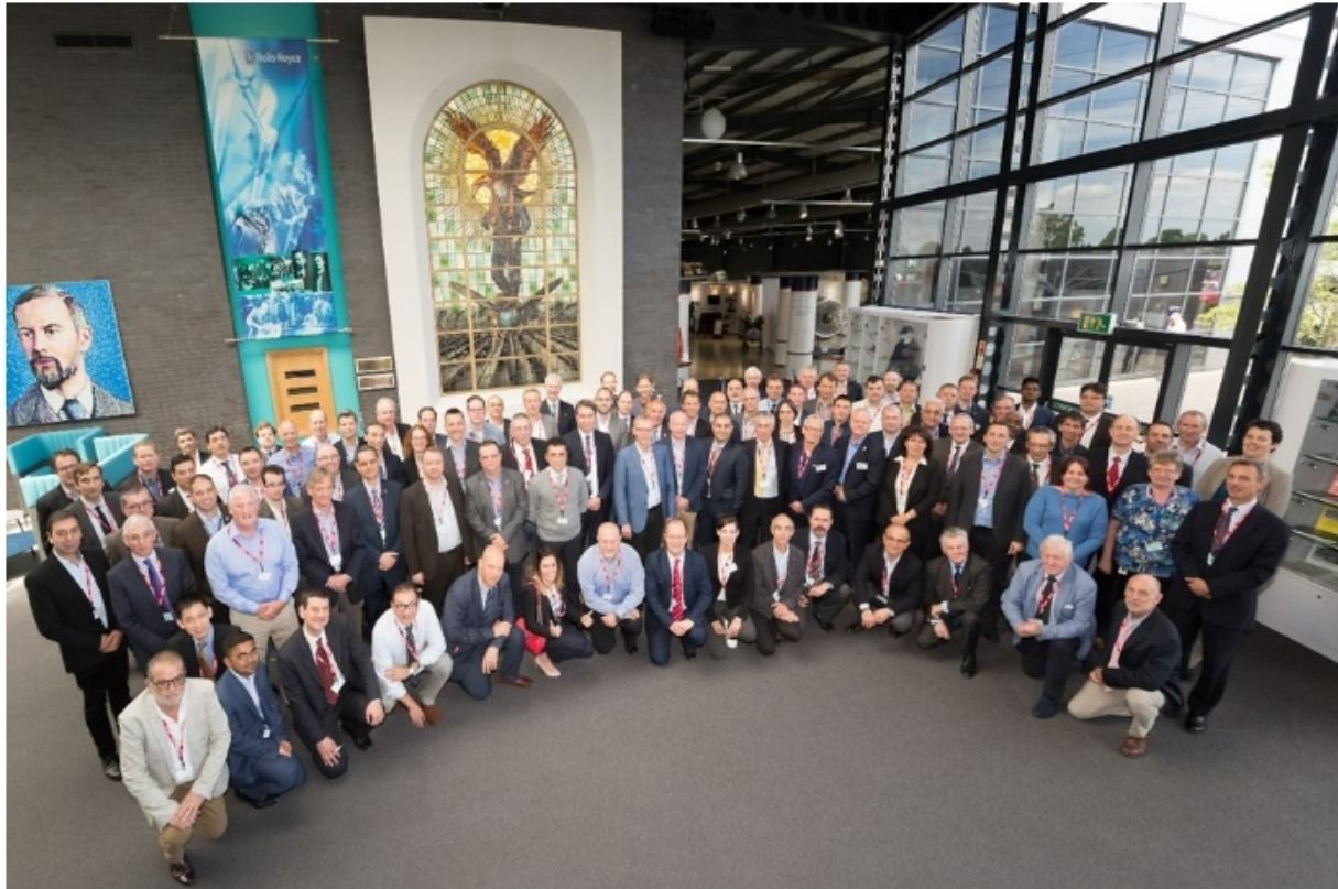
Photograph of the participants at the workshop taken in the beautiful lobby of the Rolls-Royce Learning and Development Centre